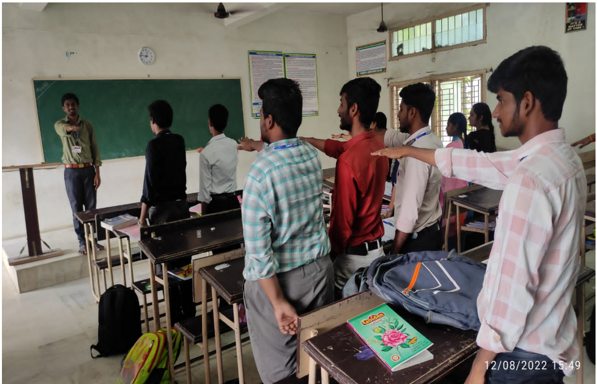
Students participating in Pledge against Drugs