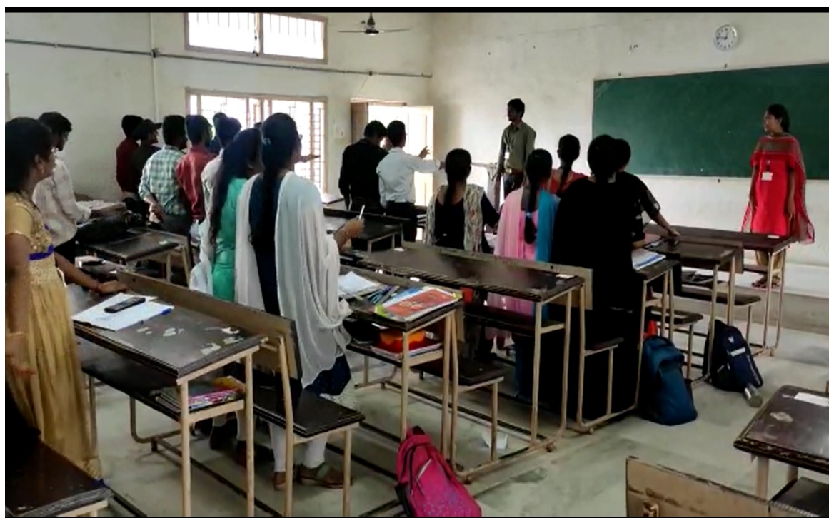
Students participating in Pledge against Drugs