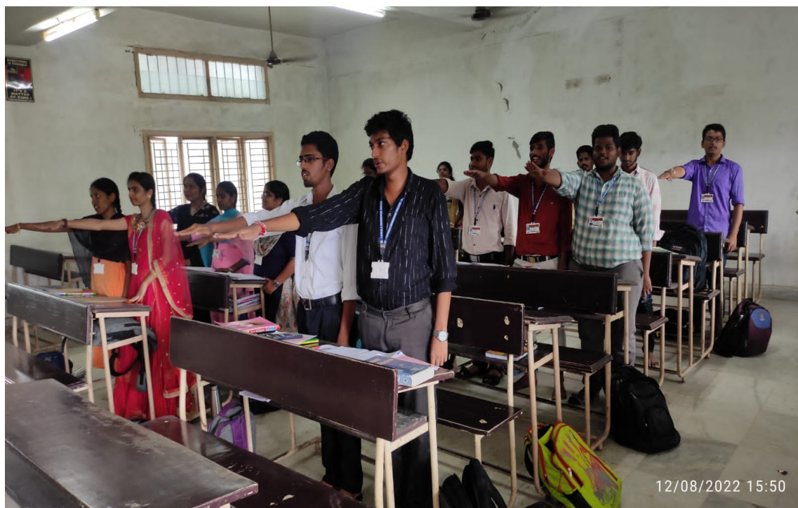
Students participating in Pledge against Drugs